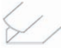
Inside Corner/ Base 10' TC-14