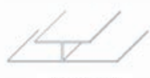
H-Trim 10' TC-H

P.O. Box 130 35 C Meredith Street Manitowaning, ON POP 1N0 Tel./Fax. 705-859-3637 Toll Free: 1-855-859-3637 www.terrastar.ca