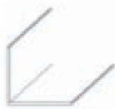
Outside Corner 10' TC-13