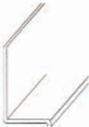
Base 10' PVC-7