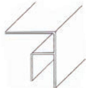
Inside Corner 10' PVC-14